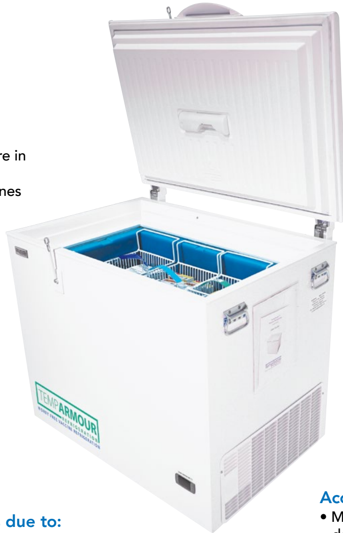
38"W x 28"L x 35"H

Large Capacity - Holds over 2000 doses*, comparable to a 21ft 3 upright model