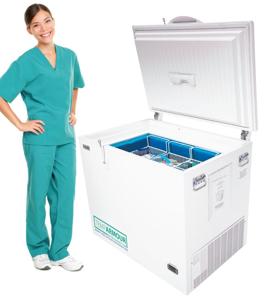
38"W x 28"L x 35"H

Large Capacity - Holds up to 2000 doses*, comparable to a 21ft3 upright model